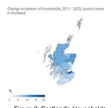
Figure 3: Scotland's Households Source: Scotland's Census 2022, Rounded Populations estimates. Figure 6 (14/9/23)

In terms of households, Midlothian saw the highest percentage increase at 17.2% increase since the 2011 census: