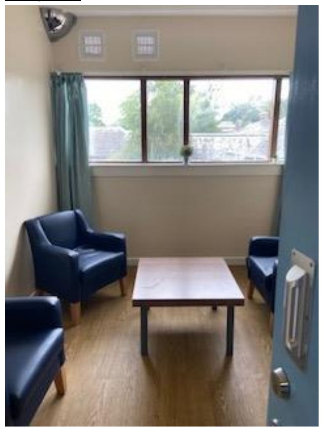
Door to Ward