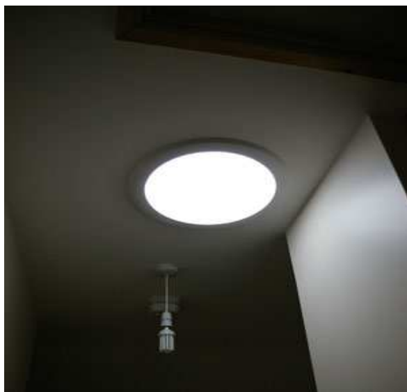
Figure 8.3: Example of a Sunpipe

At Midlothian Council's Extra Care Housing Development at Eastfield Drive there are several innovative approaches to improved energy efficiency which benefits the residents. A Combined Heat and Power Plant has been installed which generates heat and electricity for the 32 extra care flats which reduces the cost of fuel bills for these tenants and is also more efficient than being reliant on the national grid for all electricity needs. Sunpipes have also been used in the building which provide daylight in areas not well served by natural light which reduces the cost of lighting, thereby leading to savings whilst also making these areas look more attractive to residents (as shown in Figure 8.3).