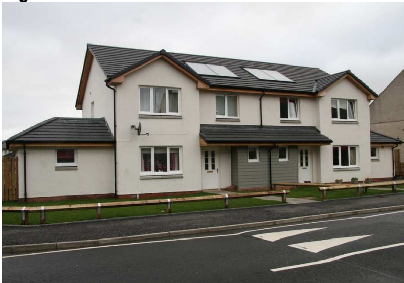
Figure 8.1 – Solar Panels on Council New Build Housing

In addition, at the New Park Gardens, Gorebridge and Eastfield Drive, Penicuik and Woodburn Road, Dalkeith sites, 100% provision of solar water heating has been achieved.