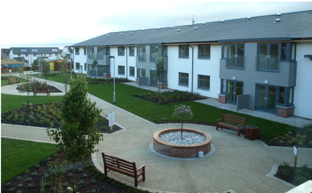
Figure 9.1: Cowan Court Extra Care Housing Development

The Council is working with health colleagues to deliver a flexible, person centred telehealth care service that will enable tenants to monitor their own conditions without having to visit their General Practitioner.