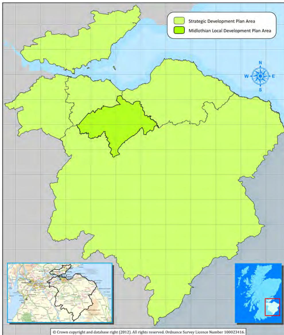
Figure 1 - SESplan and MLDP Boundaries