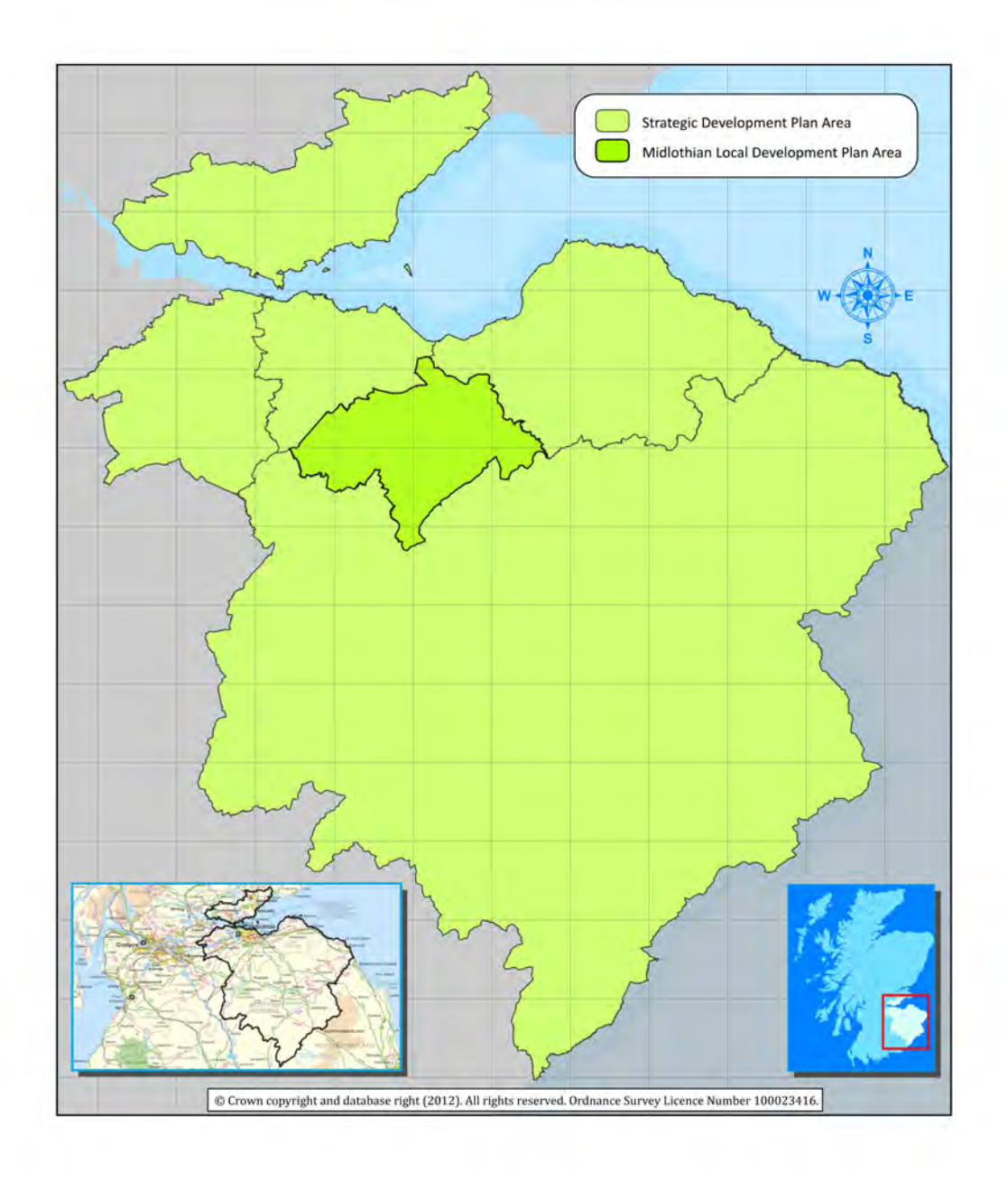
Figure 1 - SESplan and MLDP Boundaries