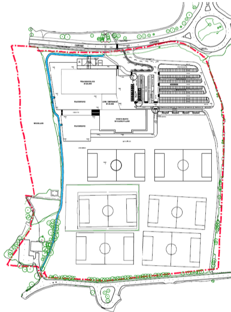
Proposed Core Path, Site Plan - 1:1000