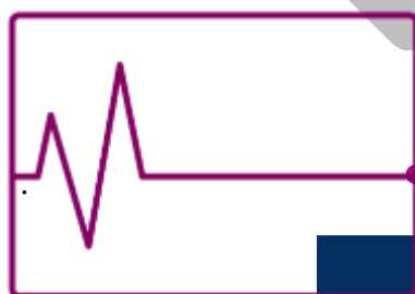
Number of drug related deaths in Midlothian

Midlothian has 10 care homes for older people - 8 privately run and 2 run by H&SCP