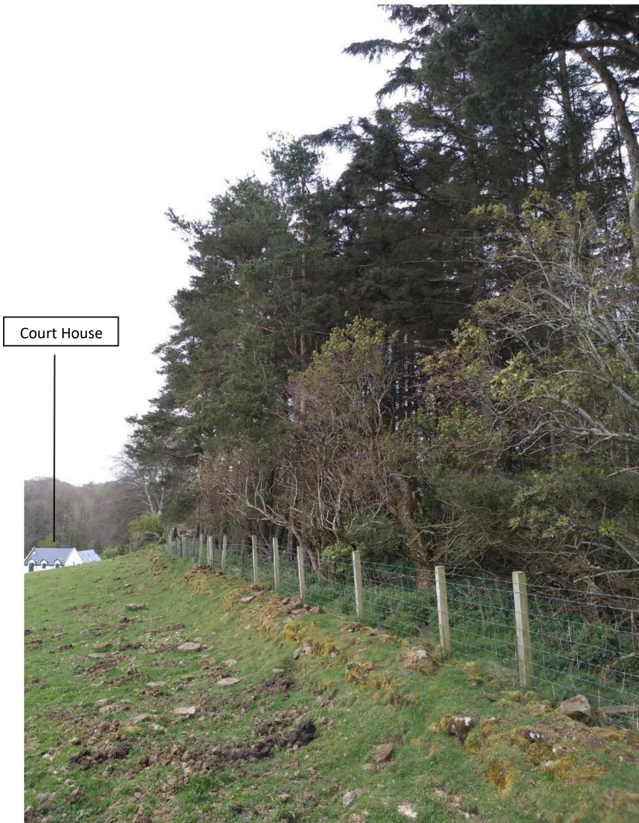
Western edge of G1 seen looking north along the boundary fenceline looking towards Court House