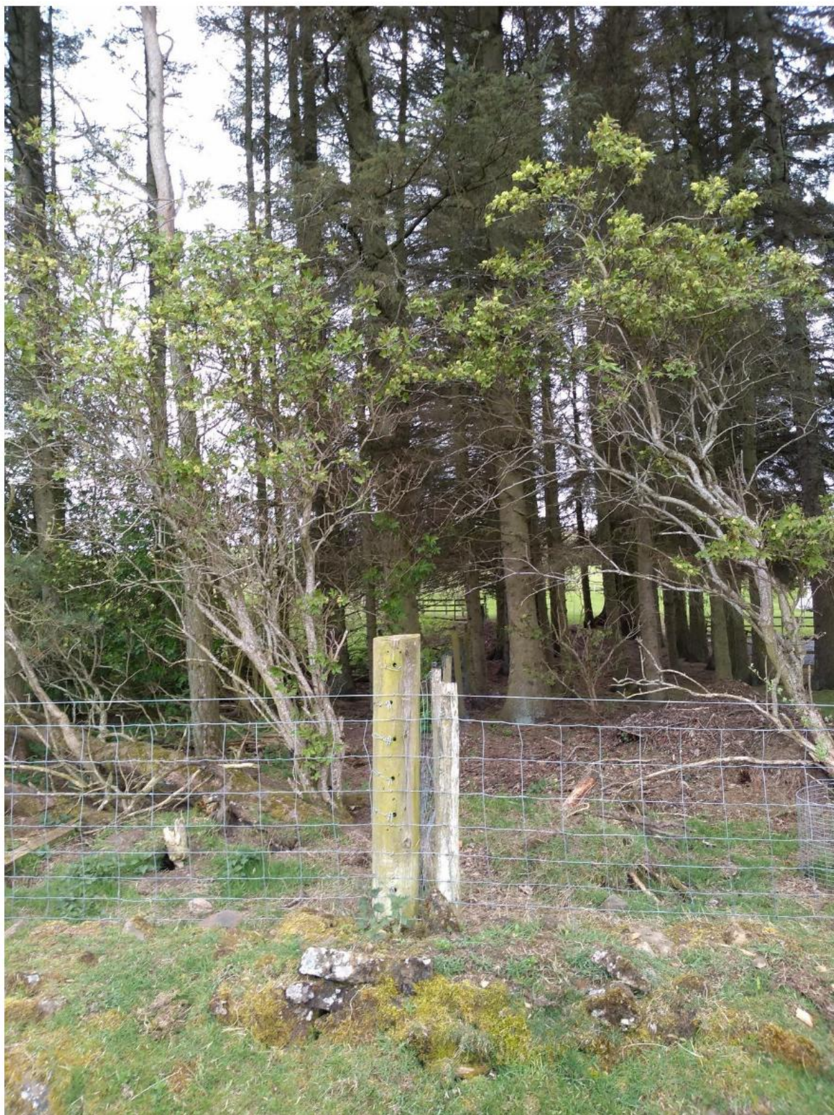
Boundary line between Little Moss and Nethermoss