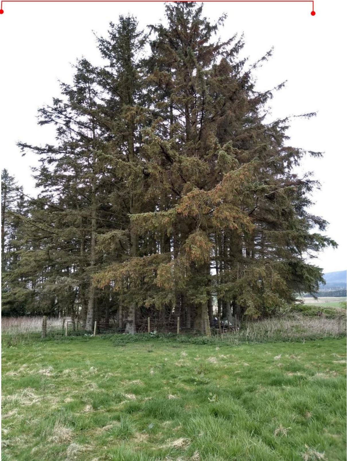
Edge of Group G1 looking south from just next to the stable block. Distant views to the Pentland Hills glimpsed in background.

Group G1: All trees visible form part of G1