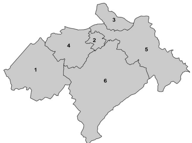
Council Ward Plan of Midlothian