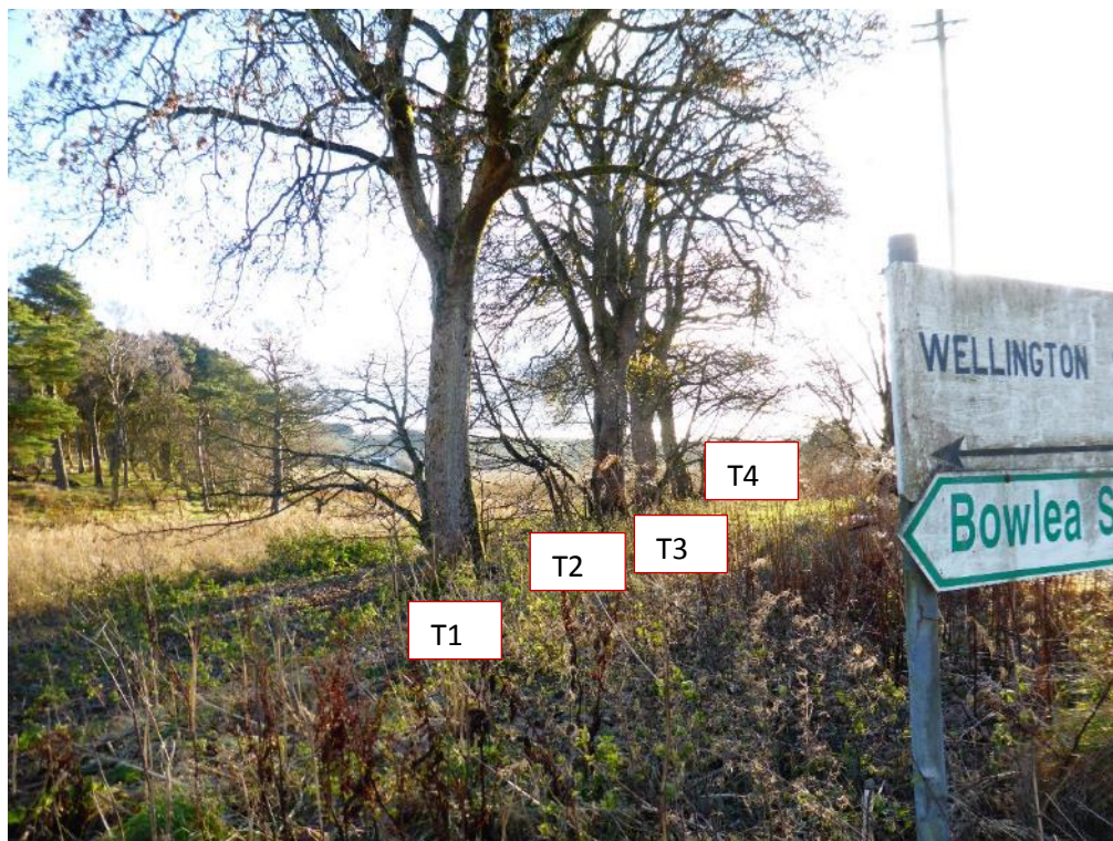
Trees 1 to 4 viewed from A701 looking south east. Group 1 seen in background.