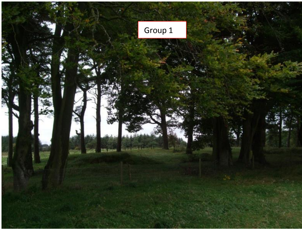
Above: Part of Group 1 (foreground) viewed looking south from within Wellington School Site. Beech trees in the foreground, Scots Pine to the rear. Filtered views through the trees towards Annsmill, the A701, and to TPO 1 Of 2014 Rosemay Farm on skyline.