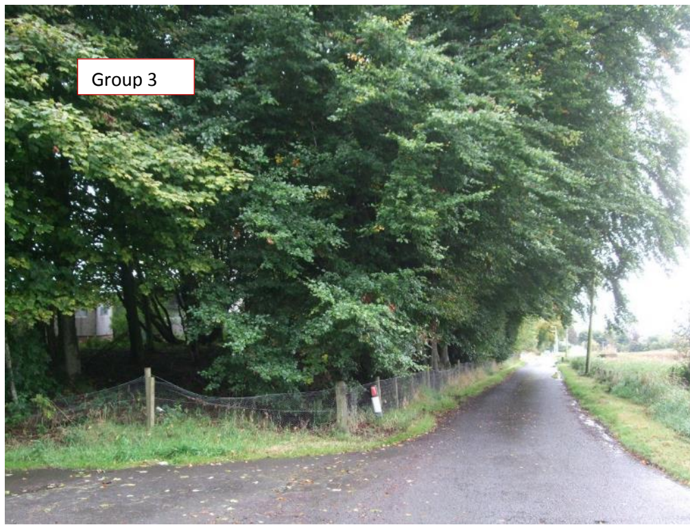
Above: Group 3 viewed looking west along access road to Wellington School