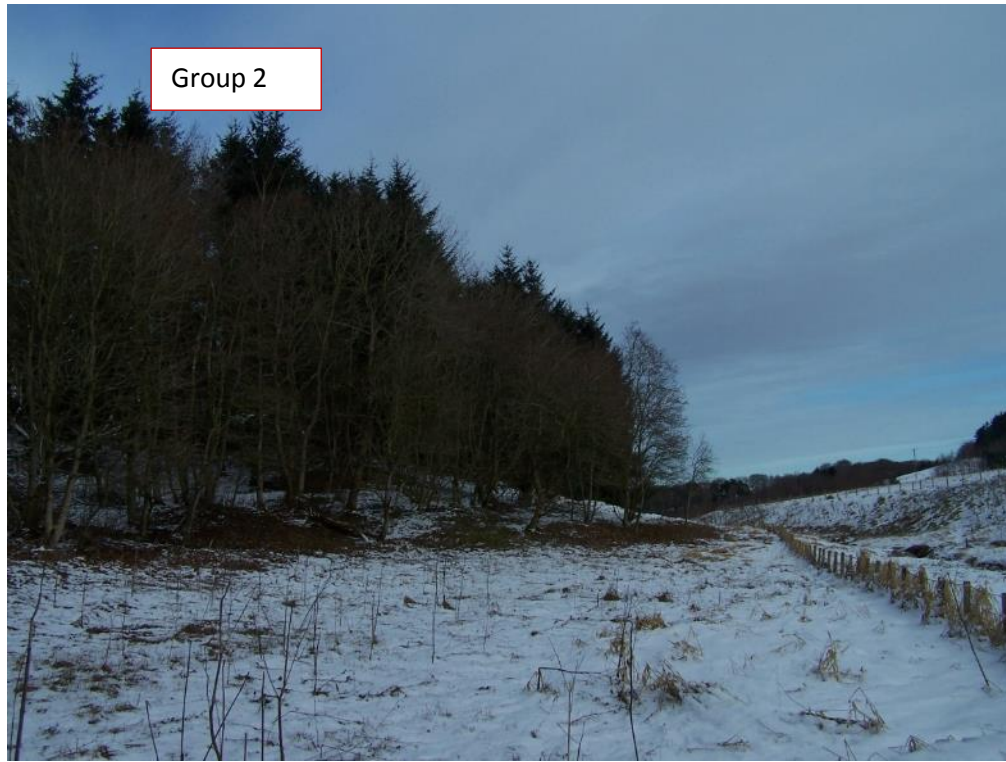
Above: Group 2 viewed looking north-west from the Lead Burn