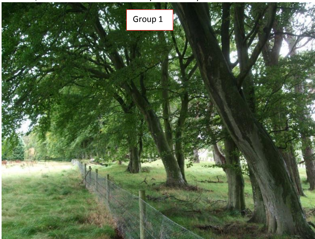
Above: Group 1 viewed looking south-east from within former Wellington School site.