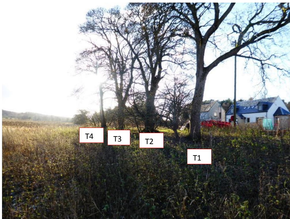
Trees 1 to 4 viewed looking south west from access road to Wellington School. New housing on the A701 seen in the background.